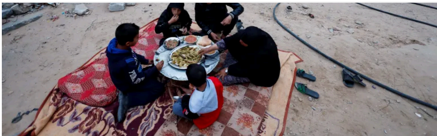
A Palestinian family eat a meal near the rubble of their destroyed house in the southern Gaza Strip

Israel-Palestine conflict Live updates Will Israel end its occupation? How did Hamas respond to Trump's Gaza deal? Can a 'one-sided' US plan d