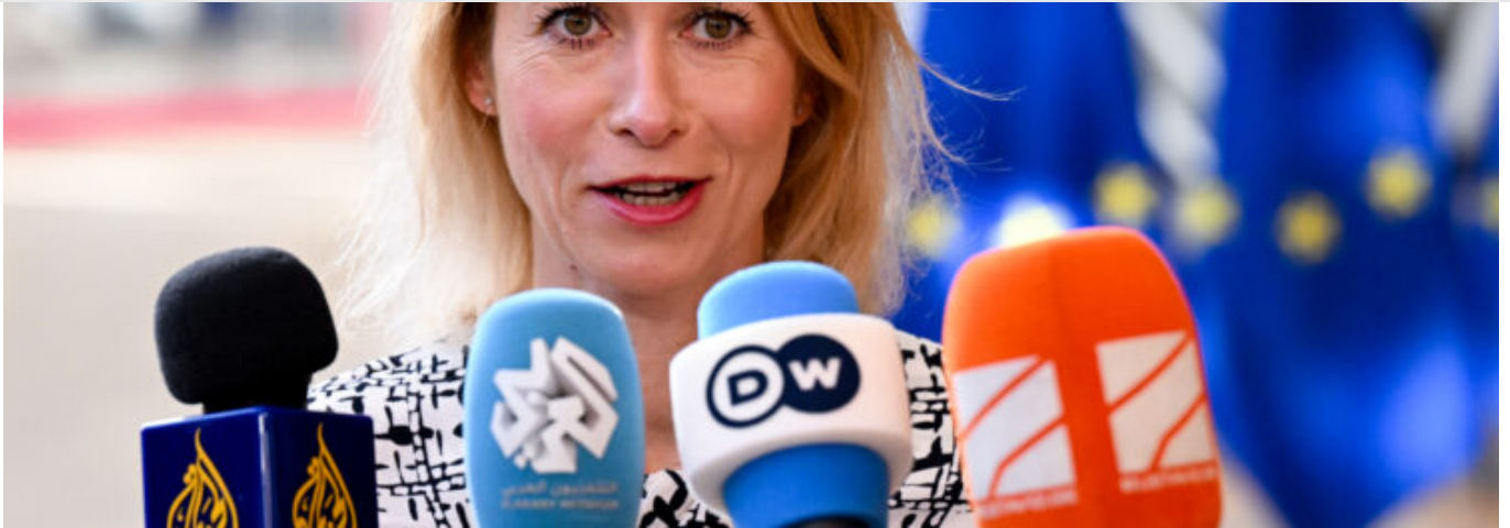
L'Alta rappresentante Ue per gli Affari esteri, Kaja Kallas, a Bruxelles, 15/07/25